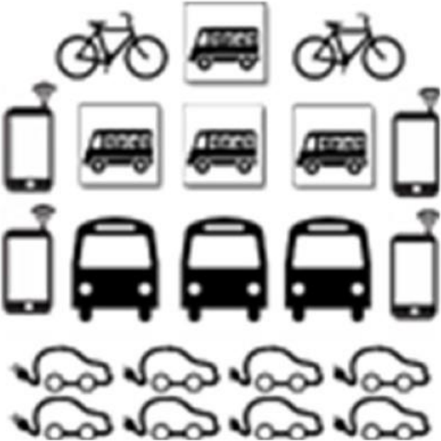
A more sustainable future