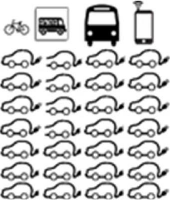
EV dominated future, slow CAV and MaaS progress.